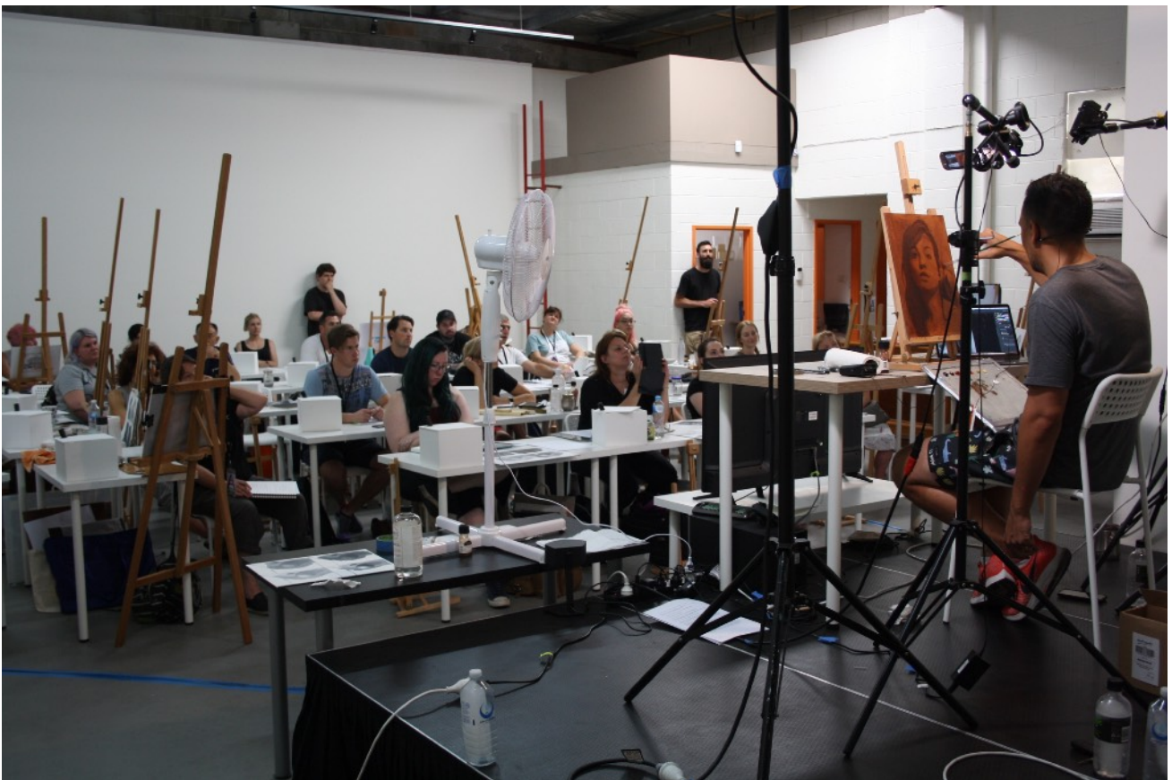
Above: Underpainting Demonstration from 2019