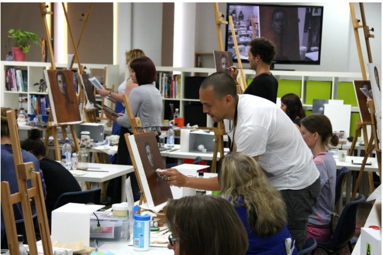
Above - a studio session in progress at the 2014 Oil Painting Workshop

Numbers are strictly limited so book now.