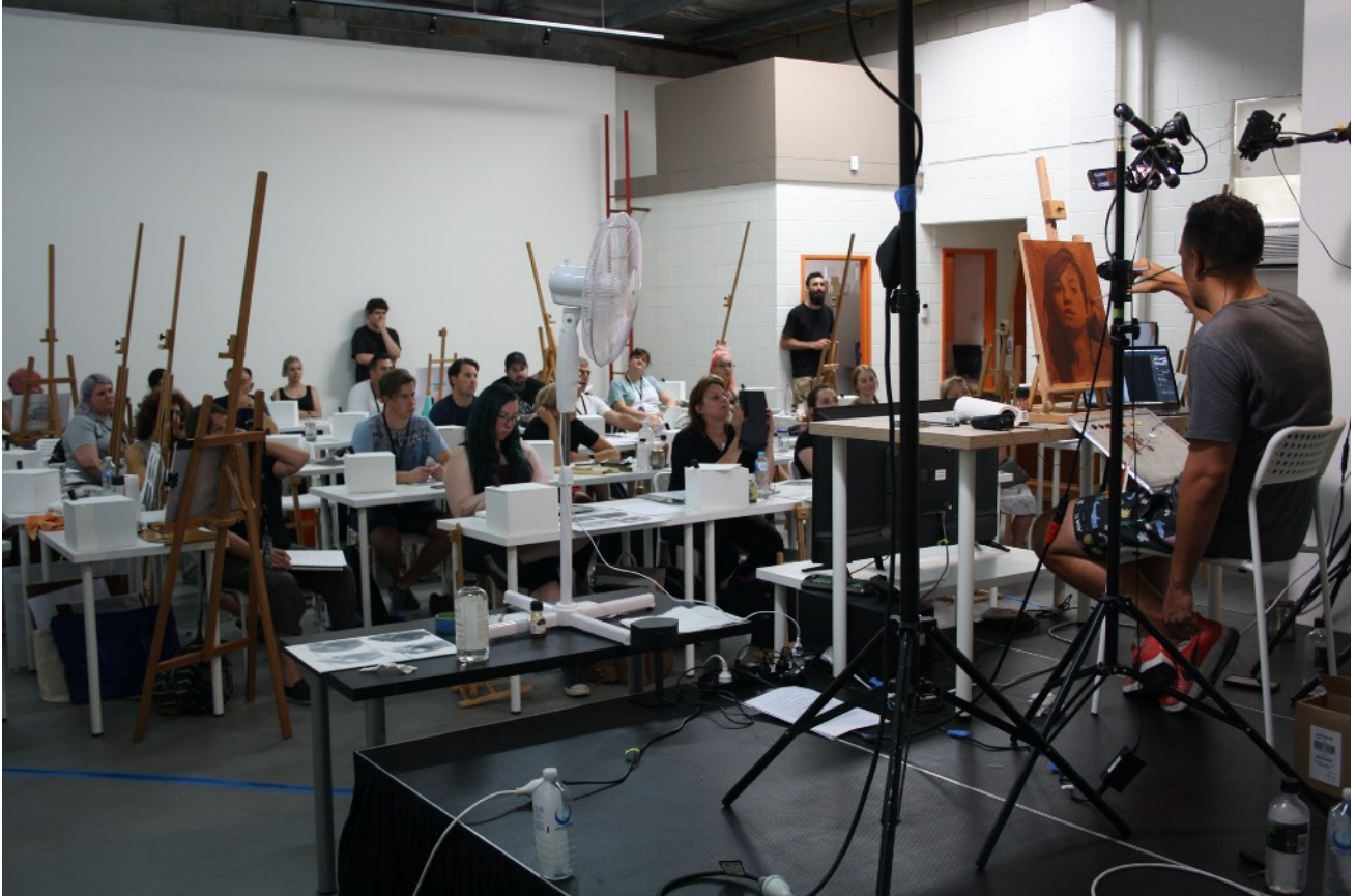
Above: Underpainting Demonstration from 2019